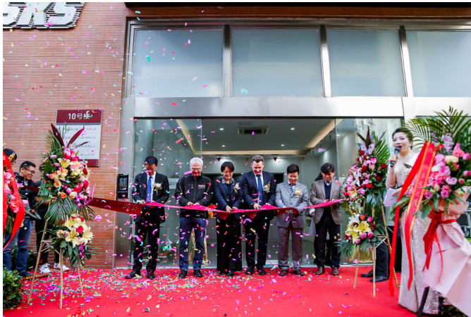
1: Official opening of the new premises